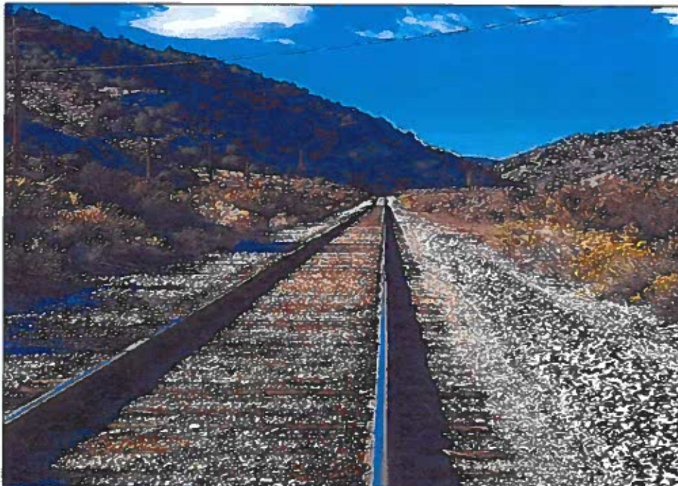
The track repair is complete thanks to the City of Ely's assistance in funding this repair. The slow order has been removed.